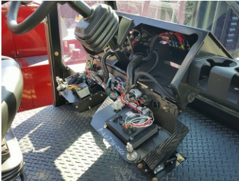
Flip-down Dash with Color/Number Coded Wiring (Standard)

Taylor Lift Trucks are designed with ease of maintenance and serviceability as a key priority. With today's engine and emissions requirements, daily maintenance checks and timely periodic service are the key to your equipment's longevity. All daily checks across the Taylor product line can be accessed from the ground or running board, ensuring that operators can complete these requirements with ease. Also, the sliding hood (on rollers), side service doors and removable floor panels open to expose the drive train and hydraulics to provide easy access for service and inspection.