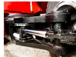
Industry's Toughest Steer Axle (Standard)