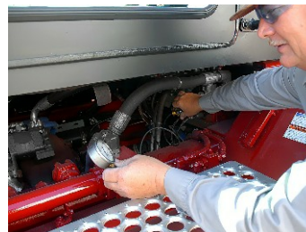
Service & Inspection from Ground Level