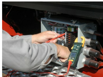
Heavy Duty Circuit Breakers/Reset Switches (Standard)