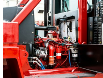
Easy Access to Drive Train & Hydraulics