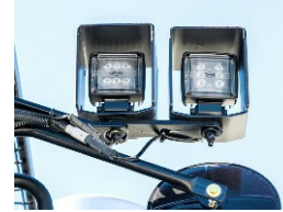
8 LED Work Lights (Standard)