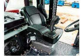
Fully Adjustable Air Ride Seat (Standard)