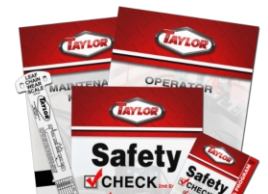
Vehicle Information Package (Standard)