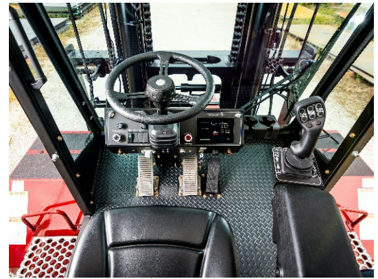
Fully Enclosed 2-door Cab - All Steel - 32,000 BTU Heater (Standard)