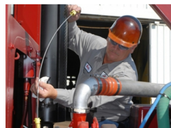
Easily Accessible Daily Checks