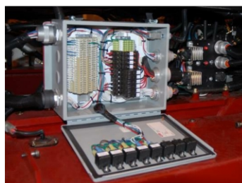
Heavy Duty Circuit Breakers/Reset Switches (Standard)