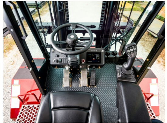
Fully Enclosed 2-Door Cab with Multiple Climate Control Configurations Available (featured cab is shown with available options)