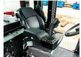
Fully Adjustable Mechanical Seat (Standard)