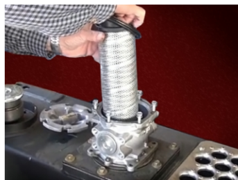
Spin-on Breather, Wire Mesh Strainer & Replaceable Internal Element (Standard)