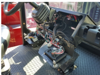
Flip-down Dash with Color/Number Coded Wiring (Standard)

Taylor Lift Trucks are designed with ease of maintenance and serviceability as a key priority. With today's engine and emissions requirements, daily maintenance checks and timely periodic service are the key to your equipment's longevity. All daily checks across the Taylor product line can be accessed from the ground or running board, ensuring that operators can complete these requirements with ease. Also, the sliding hood (on rollers), side service doors and removable floor panels open to expose the drive train and hydraulics to provide easy access for service and inspection.