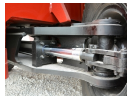
Industry's Toughest Steer Axle (Standard)