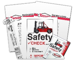
Vehicle Information Package (Standard)