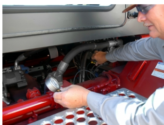
Service & Inspection from Ground Level