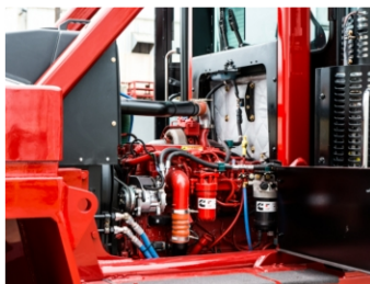
Easy Access to Drive Train & Hydraulics