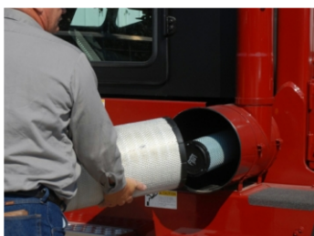
Donaldson Air Cleaner with Safety Element (Standard)