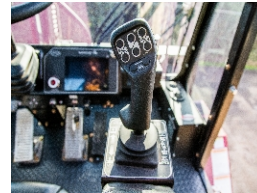
11 Button Command Joystick (Standard)